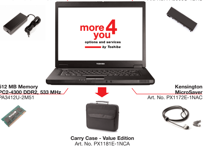
512 MB Memory PC2-4300 DDR2, 533 MHz PA3412U-2M51