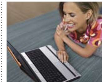
SATELLITE M60 THE STYLISH 17" WIDESCREEN MULTIMEDIA CENTRE