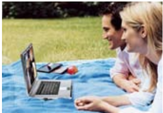
With two lamps, the Qosmio G20 display is bright enough for any lighting situation.