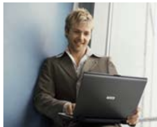
SATELLITE M40 BEST VALUE FOR MOBILE MULTIMEDIA.