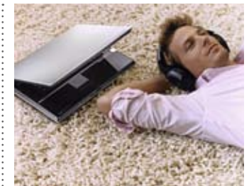
QOSMIO F20 / G20 THE ART OF SMART ENTERTAINMENT