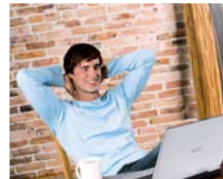
SATELLITE M70 / SATELLITE PRO M70 THE STYLISH WIDESCREEN PERFORMER.